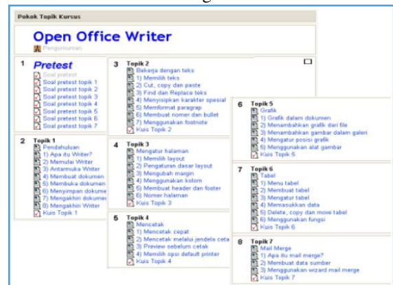
Figure 4 . Open office calc learning materials

Open Office Writer is a word processing application that is always needed in making activity proposals, correspondence, scientific articles, etc. The word processing material consists of 7 topics covering introduction, working with text, arranging pages, printing, graphics, tables and mail merges. In addition, it is also completed with pretest and posttest for each topic discussed. A complete view of the material can be seen in Figure 3.