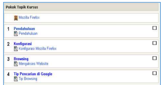
Figure 5. Mozilla firefox learning materials

Mozilla firefox is a browser application that is needed in searching for information on the internet. With a browser looking for information on the internet can be done easily, quickly and efficiently. The mozilla firefox material consists of 4 topics which include an introduction; mozilla firefox configuration; access the website; and google search tips. The appearance of this material can be seen in Figure 5.