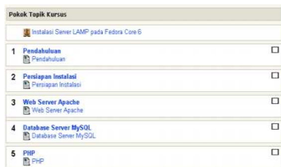
Figure 6. Installing LAMP Fedora core 6

Installing applications on fedora core 6 is an installation process to place an application program on linux fedora core 6. This installation needs to be done because it meets the application demands required by the user. The material provided in this lesson consists of 7 topics covering the installation method; shell commands; create a local repository; program installation; font installation; installation using RPM and installation using source code. A complete view of the material can be seen in Figure 7.