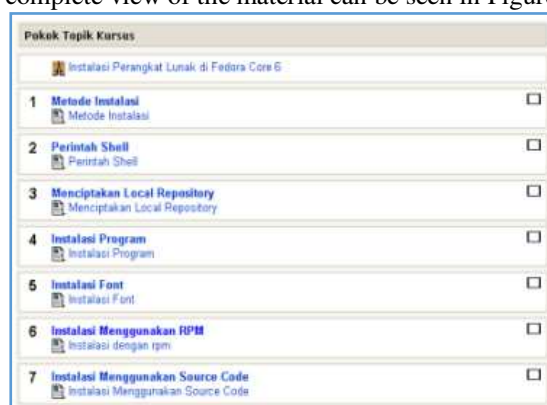
Figure 6 . Software installation on fedora core 6

Installing applications on fedora core 6 is an installation process to place an application program on linux fedora core 6. This installation needs to be done because it meets the application demands required by the user. The material provided in this lesson consists of 7 topics covering the installation method; shell commands; create a local repository; program installation; font installation; installation using RPM and installation using source code. A complete view of the material can be seen in Figure 7.