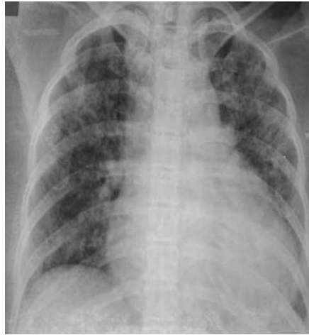
Figure 4. Anteroposterior CXR at second discharge - showed resolution of the infiltrates and opacities and the formation of fibrosis on both lungs

symptomatic COVID-19 (4–12 weeks) and pasca-COVID-19 syndrome (>12 weeks). 3 The clinical symptoms of this syndrome include fatigue, breathlessness, cough, joint pain,