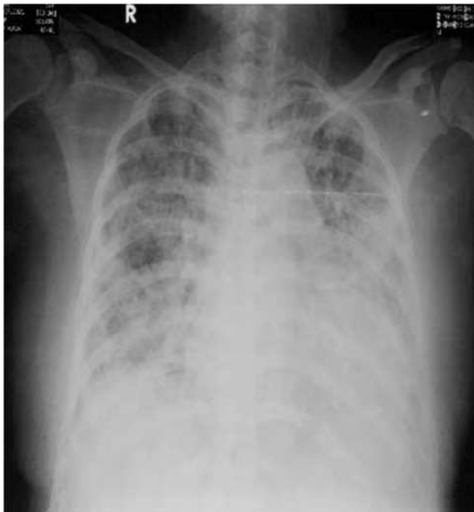
Figure 2. Anteroposterior CXR at first discharge - showed infiltrates on both sides of the lungs and cardiomegaly