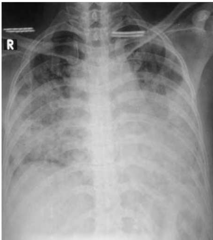
Figure 1. Anteroposterior CXR at first admission - showed infiltrates, ground-glass opacities in both lungs and cardiomegaly