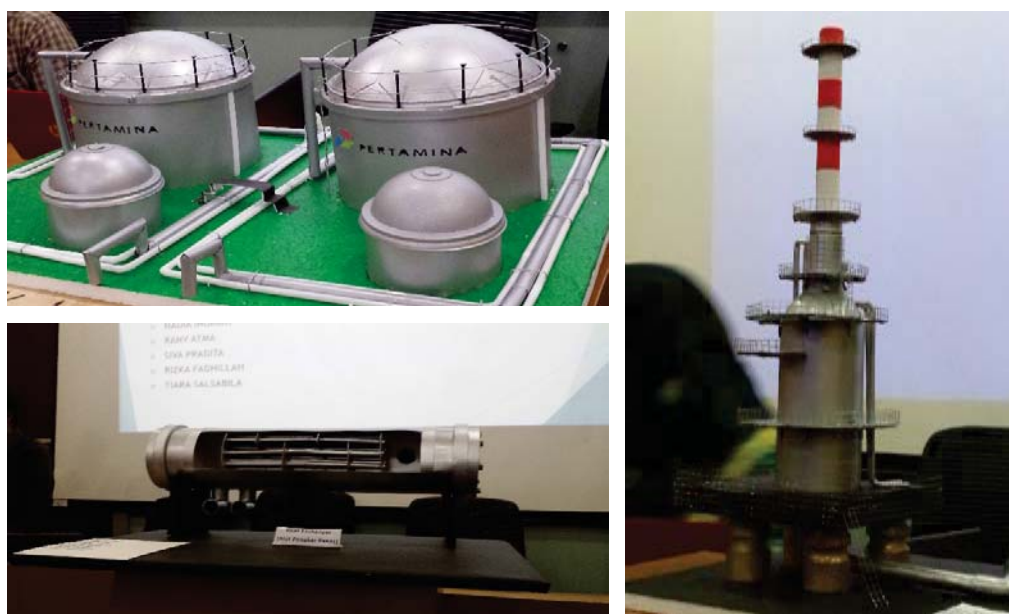
FIGURE 3. Mockup Sample of Process Units designed by the Students

Industrial visit to Pertamina Refinery Unit (RU) IV Cilacap, Central Java, was held on the 5 th of April 2016 followed by 95 students divided into 10 groups. Each group has chosen a unit process that has been discussed more deeply in the group report. The unit in the forms of a poster and a mockup is then presented and contested. Figure 3 shows several models of process units in Pertamina RU IV Cilacap, Central Java.