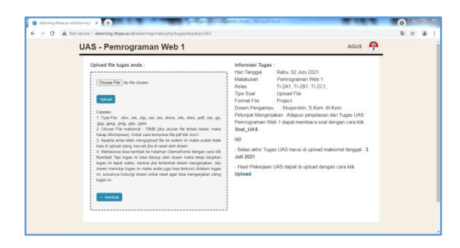
Figure 3.4 Project Page Display

The picture above shows the display of the student learning activity page. So, students can access the material provided by the lecturer on the figure 3.4