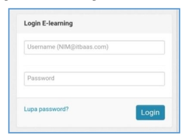
Figure 3.1 E-Module Login Page Display

The results of the e-module display using the project based learning model are as figure 3.1