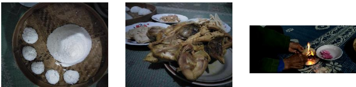
Figure 3. Informant A is burning incense in the " Genduri " procession

magical information. The " Slametan " or " Genduri " procession is carried out by inviting neighboring neighbors so that community gatherings occur. When the people gather they are given information from the spiritual leader that, Merapi will erupt on a certain day (according to the information obtained by a spiritual figure) the community is expected to remain calm and alert. The results of an interview with M, that: "The people of Wonolelo Village still believe in magical matters related to events before the Merapi disaster (Friday, 09/20/2019)". Local wisdom in Wonolelo Village before facing the Merapi eruption still exists.