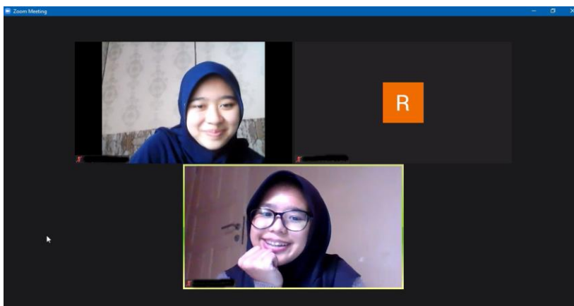
Figure 1 Students' facial expression during online collaborative writing

The interview presents students' enjoyment during online collaborative writing through google document. Students felt that they enjoy writing a text collaboratively using google document. Google document assists them in facilitating their writing activity. In addition, students found that they enjoyed online collaborative writing because their pair is their close friend. It helped them to communicate well and have an enjoyable environment during the writing activity. To strengthen students' statement in the interview, photograph below show students' facial expression during online collaborative writing activity.