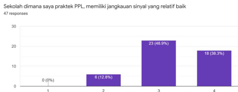
Figure 3 Quality of internet Signal

To portray the quality of internet signals, the researchers illustrated them in the figure 3 below: