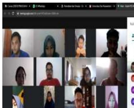
Figure 2. Distance learning

Figure 1 showed that all students were together in class room, they can create social interaction between each other. Teacher can stand in front of classroom and made discussion during the class. Meanwhile Figure 2 described students and teachers really depend on internet connection, they had lack of social interaction because they were in different area. Both classroom and distance learning had strong and weaknesses in teaching learning process.