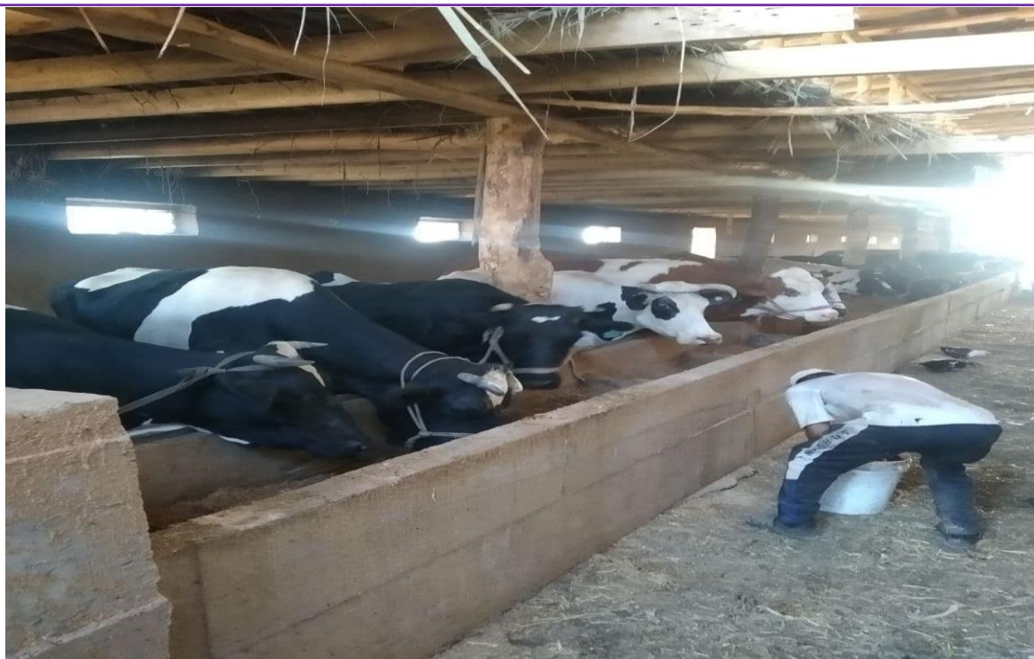
1-picrure. Feeding cow progress in the experiment