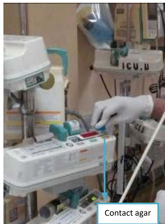
Figure 1. Syringe Pump as One of Sampling Spot in This Study

The samples were taken from the inpatient units of surgery department, pediatric intensive care unit (PICU), ICU, emergency room (ER), neonatal intensive care unit (NICU), and obstetrics and gynecology department in the hospital. The total number of equipment surfaces sample taken were 72. Of the 72 samples, 36 samples were tested with Caviwipe® and 36 samples were tested with CMGH's 70% alcohol tissue.