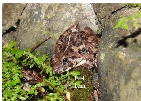
Fig 3. Fejervarya limnocharis