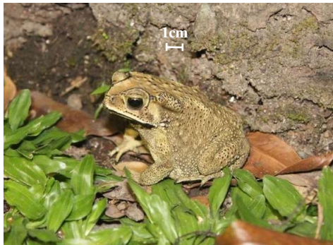
Fig 1. Duttaphrynus melanostictus

3b Head without a pair of parietal embankments, reddish, brownish, and gray with black "warts", Body around 50-80 mm . ..... Bufo melanostictus