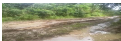
Figure 2. Road condition in Kayu Ara . Village

From the map above, it can be seen the condition of a small village with inadequate road infrastructure. This makes it difficult for people to carry out activities such as school, work and even for treatment. Although this village has been around for a long time, the provincial level roads are very worrying.