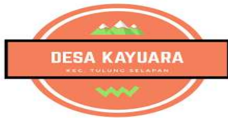
Figure 1. Ara Kayu Wood Village Logo

birth, shortness of breath and so on, it is less comfortable and constrained. The following is a map and condition of the Kayu Ara village road, Kec. Tulung Selapan, Kab. OIC South Sumatra: