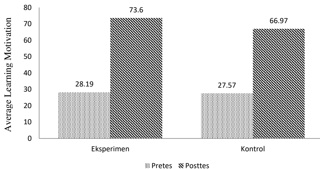
Figure 3. Mean Pretest and Posttest of Students' Motivation in Experiment Class and Control Class

The mean results of the pretest and posttest learning motivation for the experimental class and the control class to see the difference in the average learning motivation of students can be seen in Figure 3.