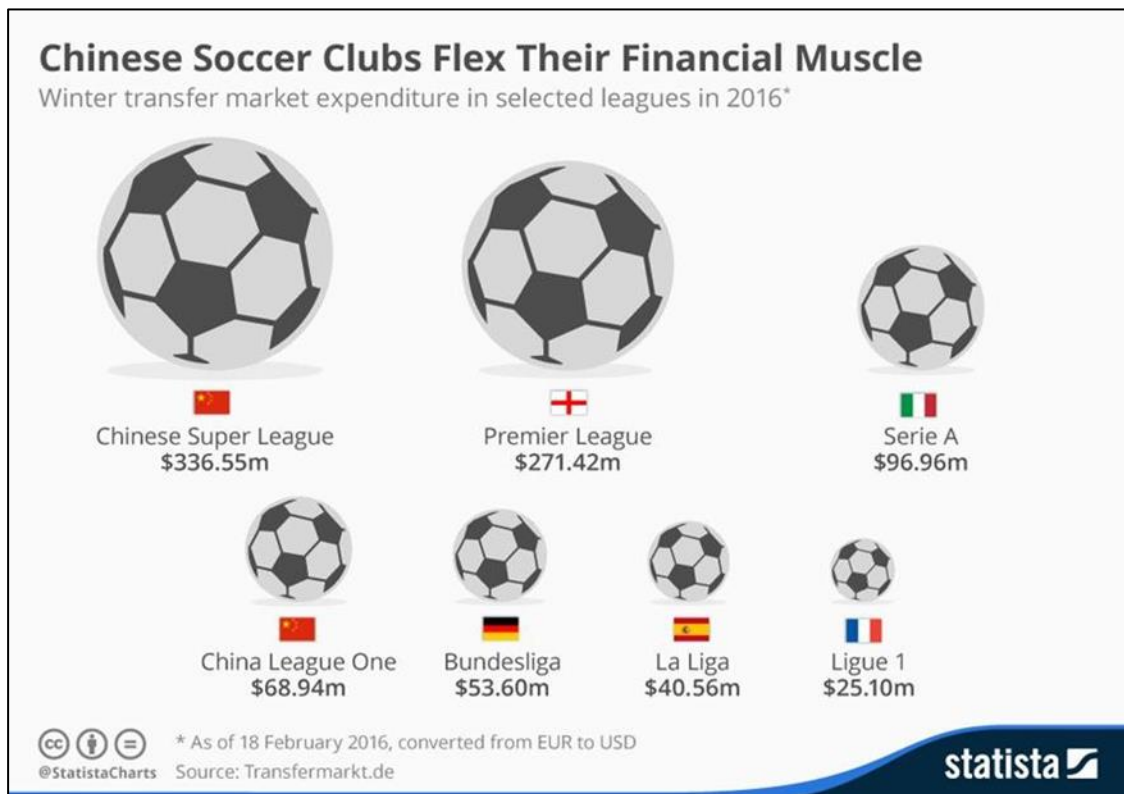
Picture 1. Money spent during Winter Transfer Window 2016.