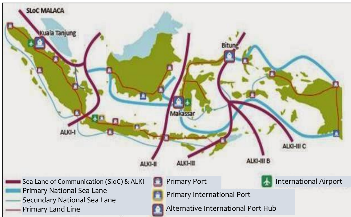
Figure 1. ALKI I Route

a component that plays a role in supporting KRI or Elements, the base needs to be well-equipped, in accordance with international standard, as a requirement for an ideal base. The Bangka Belitung Naval Base is one of the components of SSAT (Integrated Naval Weapon System), which belongs to the Komando Lantamal III Jakarta. Currently, the Bangka Belitung Naval Base consists of 4 (four) naval posts (Posal), namely Pangkal Balam Posal, Muntok Posal, Tanjung Pandan/Mendana Posal and Manggar Posal. 4