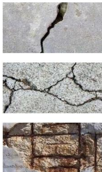
Figure 1. Examples of images with respected types of cracks, from top to bottom, early thermal contraction, plastic shrinkage, and corrosion reinforcement crack images

On the other hand, the dilation operation works by growing or thickening part of an image by the structuring element's size [12].