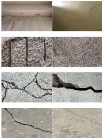
Figure 3. Examples of images in the Database; Database A (top), Database B (middle), and Database C (bottom)

These various databases were analyzed using different types of classification. As mentioned before, the classifier used in this research was a simple Euclidean distance nearest neighbor. For Database A and Database B, the classifier's calculation is directly compared to the crack and non-crack images. For Database A, the classifier calculation used seven crack images and seven images of non-crack with one image as testing image and the rest 13 images of training images. For Database B, the classifier calculation used four images of crack from the same crack and four images of non-crack with one image as testing image and the rest seven images of training images. For Database C, due to many images, the system employed two-fold cross-validation as a statistical approach to help the system manage the images before the classification process. The images were scrambled first and then divided into two-fold training images, and testing images with each fold consisted of 2000 images of crack and non-crack images. After calculating the nearest distance, the system changed the training to be testing images and vice versa. Finally, the accuracy of the system was calculated in percentage. All simulations in this research were run using MATLAB 2016a and a computer with Intel Core i7—7500U CPU @ 2.70 and 2.90 GHz with 16Gb RAM.