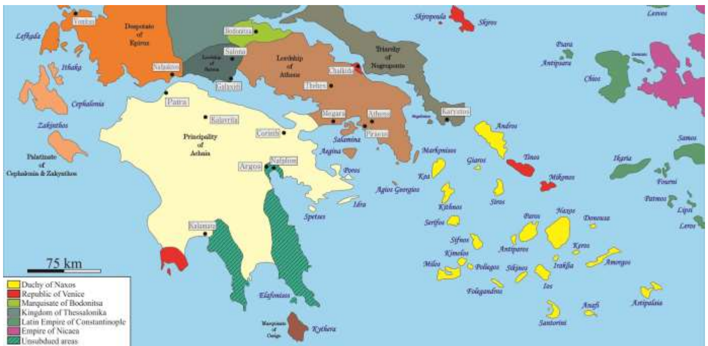
Fig. 3: The Duchy of Naxos in 1214, and the various administrative units and sovereign territories of Central Aegean and Greece (after [71]).

by 1210 AD, and the nascent Duchy of Naxos expanded, as more Cycladic islands came under Italian control (Fig. 2). However, after only a century of Venetian rule, infighting between Italian forces - back then there were numerous competing Italian states - as well as clashes with the temporarily rejuvenated Byzantine Empire weakened the Venetian forces. After the fall of Constantinople in 1453 and the nominal end of the Empire, the Ottomans concentrated their efforts in conquering any and all European held territory in the Aegean [71].