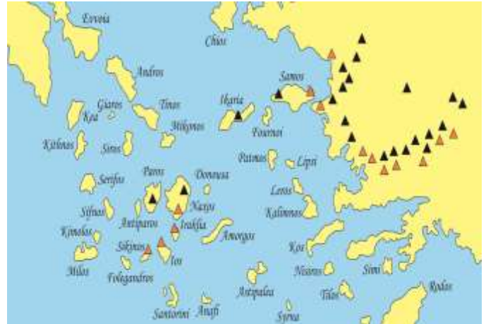
Fig. 2: Metabauxite occurrences in the islands of the Aegean and in Asia Minor. The corundites are represented by black triangles and the diasporites by orange ones (after [47]).

Eocenic HP-LT event, followed by a Late Oligocene-Miocene MP-LT event, corresponding to the metamorphic phases mentioned above for the Attic-Cycladic complex. Mineralogical investigation indicates that the first event belongs to the glaucophanitic facies and the second to the greenschist-amphibolitic facies grade.