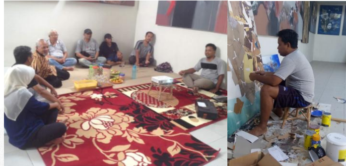
Figure 1. Brainstorming Process and Exploration of Materials and Techniques into Painting Works

presented by keep relying on the honesty of the material, but there are some that are actually contrasted with the character of the material. The game image material supported by the application of the principle of incubation that is presented in the structure of the painting is a manifestation of the explorations conducted. Exploration of shape, color, composition, texture integrates in one field of painting as a totality of paintings based on predetermined work concepts. The visual shock achieved can contribute to the enrichment and diversity of the aesthetics of existing paintings.