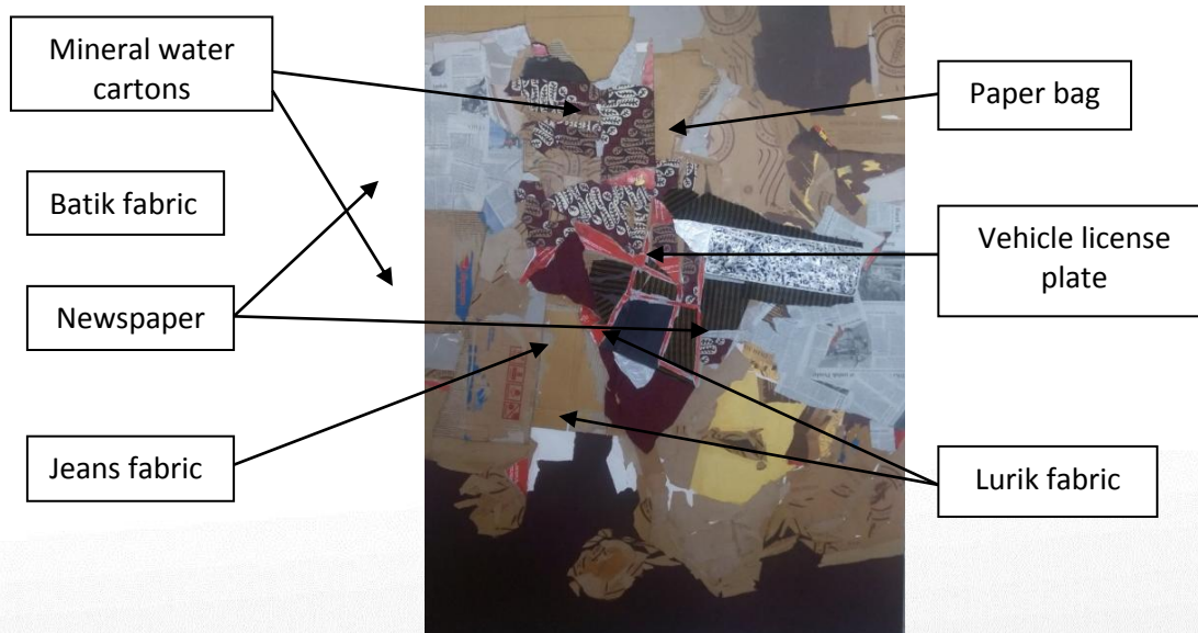
Figure 2. Recycle art painting entitled "Contradiction"