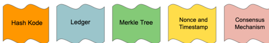
Figure 1. Components on the blockchain

Blockchain technology has 6 components in the image below: