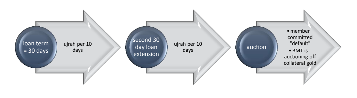
Figure 2 Gold Pawn Auction Mechanism at BMT Mitramu Jepara

Within 10 days, members make repayments to get a gold guarantee back. Payment procedure; Members come to the office with an SBP (Loan Proof), and the original KTP is submitted to the cashier. The cashier calculates the ujrah and loan, gives a repayment slip, then submits the SBP to the Admin. Admin gives SBP to warehouse officers to get collateral that has been paid off. The loan extension procedure and guarantee auction process can be seen in the following flow: