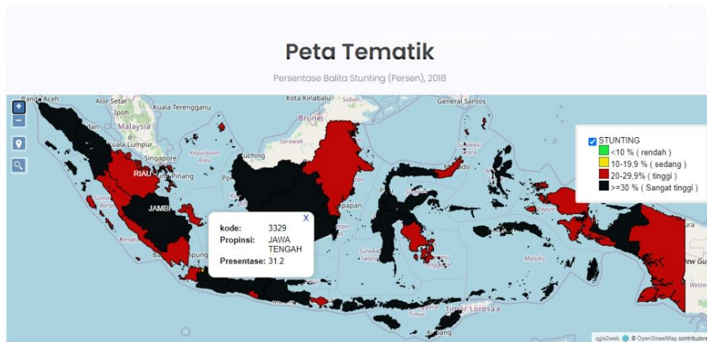
Figure 2. Mapping Toddlers Stunting in Indonesia.

Stunting toddlers were found in 34 provinces. The prevalence of stunting is categorized as a public health problem if it is "10%. [8] That is, areas with a prevalence above 10% need to make treatment efforts. So far the presentation of data is still in the form of charts or tables, whereas ad other events in the presentation of data so that the reader becomes quick to understand (figure 2).