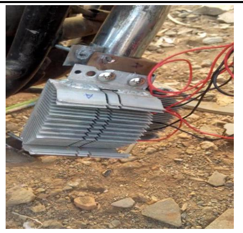
Figure 6 Experimental setup