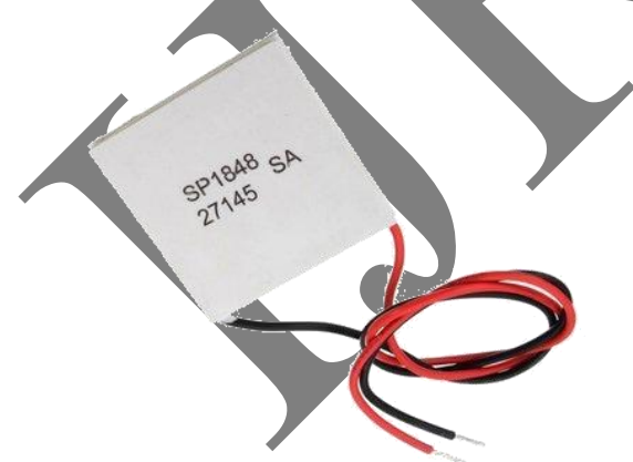
Figure 1Peltier Module

Both N-type and P-type Bismuth Telluride Bi2Te3 thermoelectric materials are used in a thermoelectric cooler