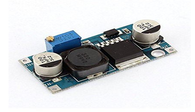
Figure 4Booster Circuit

6 V to 12 V at 500 mA: 60 turns of 36swg wire in a 0.5 mm ferrite core.