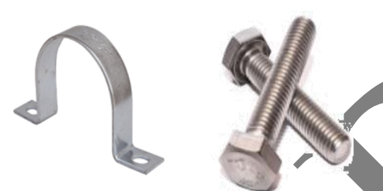
Figure 5 Clamp and bolts

Clamps and bolts are used to mount heat sink and Peltier plate assembly on exhaust pipe of bike.