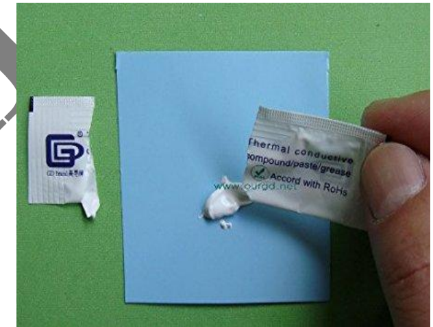
Figure 3 Thermal Grease

Thermal grease (also called thermal gel, thermal compound, thermal paste, heat paste, heat sink paste or heat sink compound) is a viscous fluid substance, originally with properties akin to grease, which increases the thermal conductivity of a thermal interface by filling microscopic airgaps present due to the imperfectly flat and smooth surfaces of the components; the compound has far greater thermal conductivity than air (but far less than metal). In electronics, it is often used to aid a component's thermal dissipation via a heat sink.