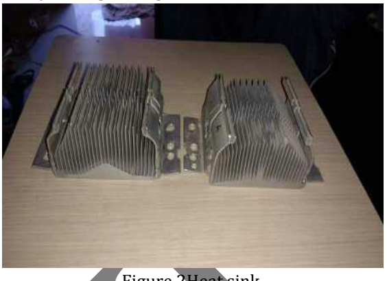
Figure 2Heat sink

temperature difference across the thermoelectric module. The heat sink is made up of aluminum due to high conductivity and light weight.