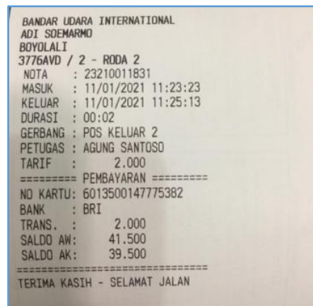
Figure 2. Aplikasi AINO