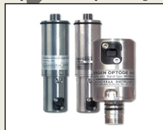
Figure1: Aanderaa dissolved oxygen sensor

The Aanderaa Oxygen Optodes[8](41300 can operate down to 300 meters) are used in the AUV to measure the oxygen level in some aquatic region .Its contains a gaseous fluorescent indicator made up of special platinum porphyrin which is molded in a gas permeable foil A black optical isolation coating is been used since this foil need to protect from sunlight as well as from fluorescent particles present in the water .During the operations the foil is exposed to the water .Now the sensing foil attached to the watertight housing window ,modulated the blue light in the water and the phase of red light is measured. To obtain the proper oxygen level from the sample region, the data in the form of red light is measured by linearizing and compensating the temperature with the help of an incorporated temperature compensating sensor.