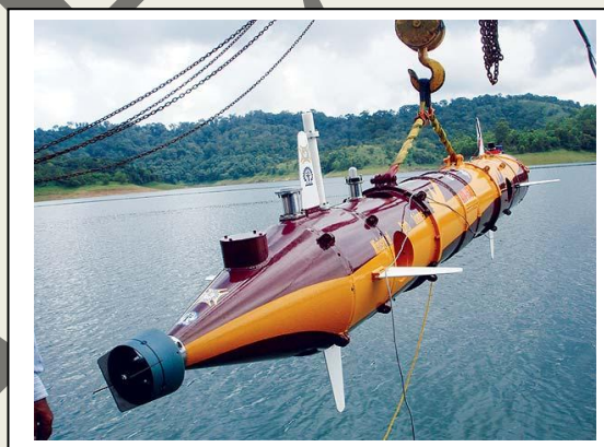
Figure 6: AUV-150 India

was developed by CMERI, Durgapur , a unit of CSIR with technical assistance of IIT,KGP .After its completion ,it was take into consideration for a trial in freshwater on January,2010 at Idukki reservoir (Kerala). The test was conducted up to October,2010. After its satisfactory performance in Freshwater, it was tested in sea water from 13 July,2011 to 17 July,2011, where it was proved to be work properly at a depth of 150 m with the satisfactory criteria. The main focus of development of this project was to fulfil the military applications like mine counter-measures, coastal monitoring and reconnaissance [4]. Its is 4.8 meter long and 50cm in diameter of torpedo shaped structure made up of Aluminium Alloy with a total weight of 490kg in air and can operate at a depth of 150 meter with a speed of 2-4 knots. As per communication system concern, AUV-150 carries a sensor (including payload sensor), altimeter, sonar, GPS and with a hybrid radio wave communication system. To operate the communication system, a Lithium Polymer battery as a source is been used.