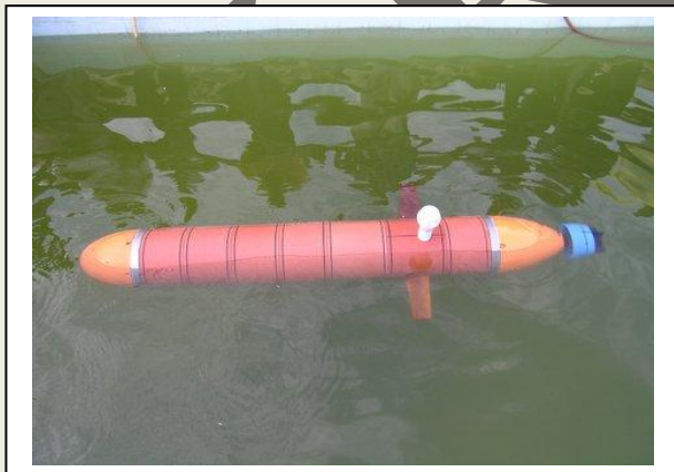
Figure 5: Maya-AUV India

An Autonomous Underwater Vehicle idea was started in the year 2003. The output of AUV idea came to known as MAYA, developed at NIO, Goa. Then after 2 years it was completed for its horizontal plan testing on May, 2005 and at last on May 12, 2006 it was ready for the missions. The vehicle (made up of Aluminium alloy) can operate at an instance for 7.2 hours , with its approximate length of 1.7m, a diameter of 0.234m with a shape of slender-ellipsoid. It can operated at a depth of 100m. Apart from the physical structure , it carries a navigation sensors (including Aanderaa dissolved oxygen sensor, Wet Labs chlorophyll and turbidity sensors) including GPS on mast and communication antenna, Lithium batteries as well as the actuators for the rudder and fins , RBRCTD (instrument) and a TRIOS (hyper spectral radiometers). The total weight of the vehicle in air is about 54kg and can move with a speed of 2.91577 knot. Since it was a joint venture of India and Portugal, its aim was to build and test the joint operation of two AUVs for marine science applications via Adl Portugal [1].