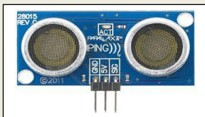
Figure 3: sonar sensor