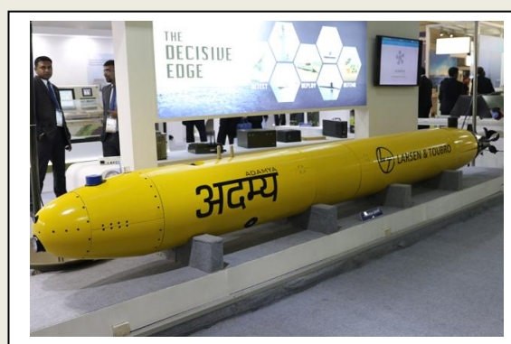
Figure 7: "ADAMYA" India

To support naval operations after CSIR's AUV-150, Larsen and Turbo (L&T) have started to unfold their wing in the field of autonomous underwater vehicle. After a long strategic workout from 2011 to 2016 i.e. 5 years, they have completed their research work on AUV and as an output they are going to achieve their success in the name of "ADAMYA" [6].