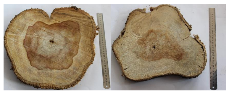
Figure 2. Heartwood of 5-year-old fast grown teak from dry site (left) and wet site (right)