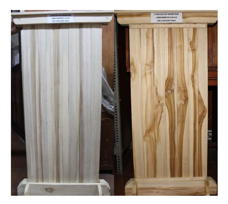
Figure 3. Appearance of the wood colour of teak wood grown from a wet site (left) and a dry site (right)

wood from the drier site due to higher redness (a*) and yellowness (b*). This result is in agreement with Nocetti et al. (2011) who noted that a dry and fertile site produced more yellow heartwood colour. Besides having drier climate, according to the ECEC (Effective Cation Exchange Capacity) value, Site 2 also has a higher ECEC value and more fertile soil than Site 1. Colour of the teak heartwood from the wet and dry sites is presented in Figure 3.