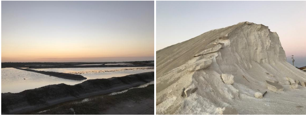
Figures 5 and 6: Shrimp farms and salt pans in Icapuí

During the interview with the coordinators (Praia do Canto Verde and Icapuí), they highlighted that the creation of Rede Tucum and the recognition are the main results. Regarding the difficulties and challenges, there is the (de)valuation of the Rede Tucum by the State, maintenance of projects and resources, centralized communication, meeting the expectations of the community regarding the financial return, the lack of specific public policies for this type of initiative, and the pressure from the conventional tourism industry.