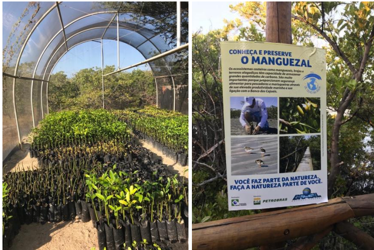
Figures 1 and 2: Algae nursery and Olho na Água project

Community Tourism". There is a project called Olho na Água and an environmental station called Mangue Pequeno, where lectures and environmental education activities are offered to the community and visitors (see figures 1, 2, 3, and 4).