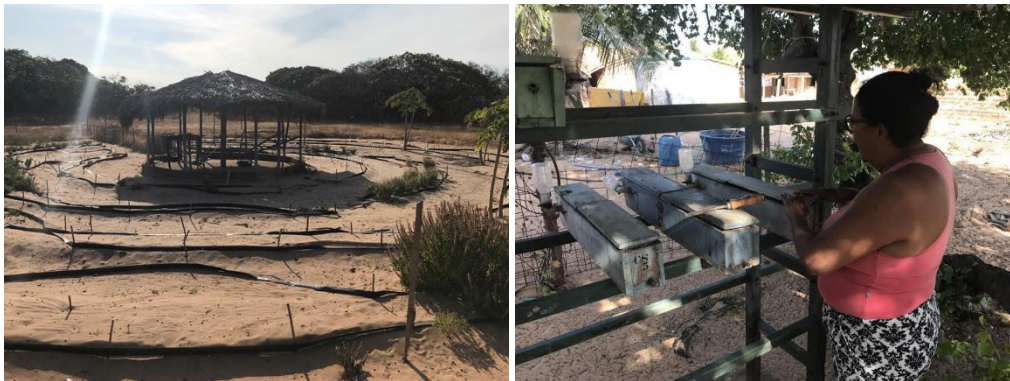
Figures 9 and 10: Community mandala and beehive

Mariscada no Coco Verde is the most famous, besides the colonial products. The community receives qualified training from Senar .