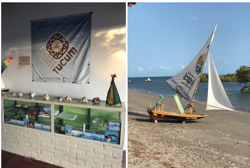
Figures 11 and 12: Rede Tucum headquarter

The Rede Tucum headquarter (figures 11 and 12) was built with support from the Italian Tremembé Association, which supports CBT projects in Brazil. The partnership began in 2000, together with the Terramar Institute, Caiçara Institute, and Prainha do Canto Verde Friends Association (currently extinct).