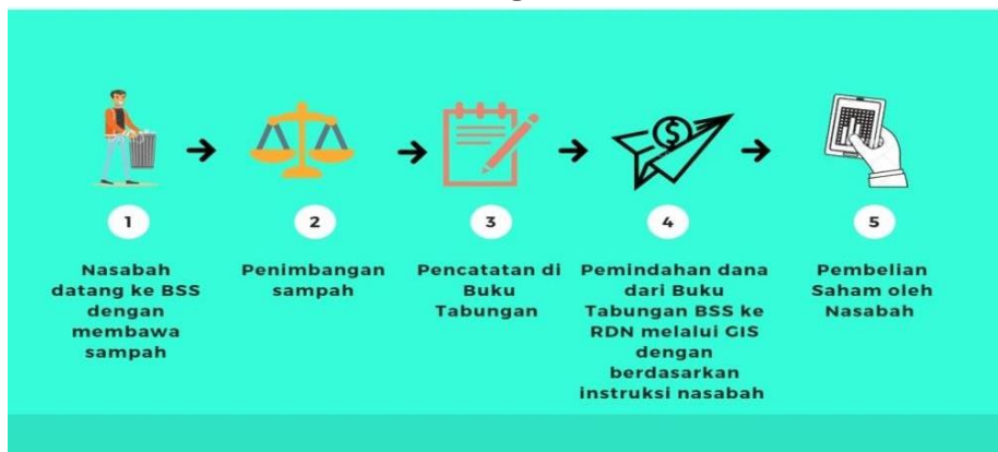
Figure III Stock Purchasing Procedure

The flow of the AS-SALAM transaction is first, the customer comes to the Islamic Trash Bank (BSS) with garbage, then the customer's trash is weighed and the results of the scales are recorded in the customer's savings book. Second, transfer of sharia bank savings passbooks to the RDN (Customer Fund Account) through GIS based on instructions from customers. Third, after being transferred the customer consults with GIS to be able to buy Islamic shares on the IDX (Indonesia Stock Exchange) through the IPOT GO application. Based on the explanation of the flow above, the flow can be described as follows: