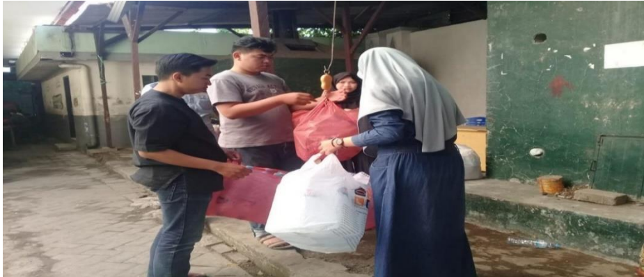
Figure II Weighing Process

The flow of the AS-SALAM transaction is first, the customer comes to the Islamic Trash Bank (BSS) with garbage, then the customer's trash is weighed and the results of the scales are recorded in the customer's savings book. Second, transfer of sharia bank savings passbooks to the RDN (Customer Fund Account) through GIS based on instructions from customers. Third, after being transferred the customer consults with GIS to be able to buy Islamic shares on the IDX (Indonesia Stock Exchange) through the IPOT GO application. Based on the explanation of the flow above, the flow can be described as follows: