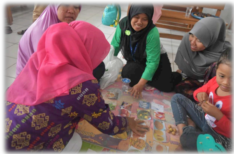
Figure 5. Knowledge and Consciousness Raising for Parents Group

Whereas in the Cinangka-Depok community, parents /caregivers group were categorized as supporting target groups. The intervention focused on their knowledge, awareness and skills to provide, control, and support children to eat healthy foods. The idea that conveyed was about the role of the importance of families in fulfilling children's nutritional needs as a support for children to achieve their future goals. In addition, the skills for them to communicate the best alternative ideas related to food consumption through communication and persuasion skills.