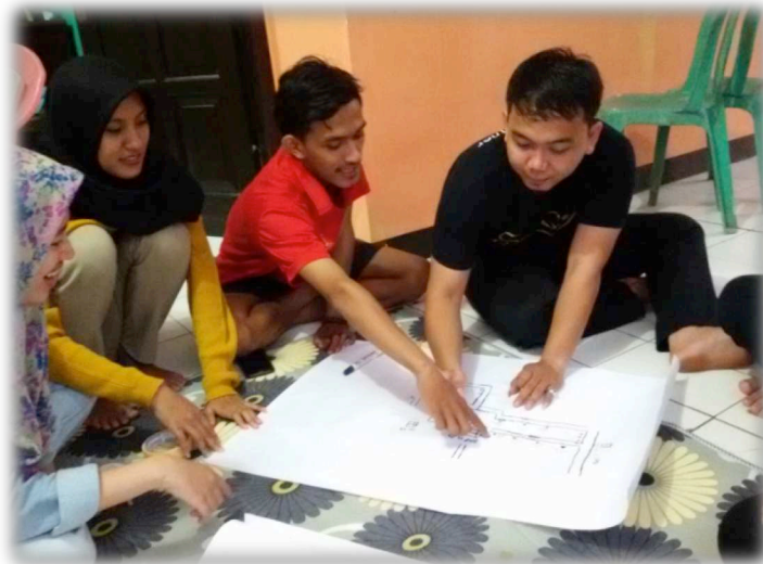
Figure 6. Youth Groups Identified their Community through Participatory Mapping

In Semper Barat-North Jakarta, we involved local leaders, children's health agents in local communities (Posyandu), and preschool teachers. They become a support group in enabling positive behavioral changes in the primary target group: parents/caregivers. For communities in Cinangka-Depok, youth groups play an active role in seeking change in their communities. Optimizing the role of youth as agents of change in their communities is carried out by strengthening their capacity to identify existing conditions, capitals, and strategies that can be implemented to achieve expected condition. Participatory mapping facilitation is needed to see the extent of children's problems related to their consumption patterns; children's access to snacks; inhibiting factors and supporting children to access healthy food; and the pattern of parenting behavior of parents, families, and communities related to the consumption of food for children (Hati, et. al, 2017).