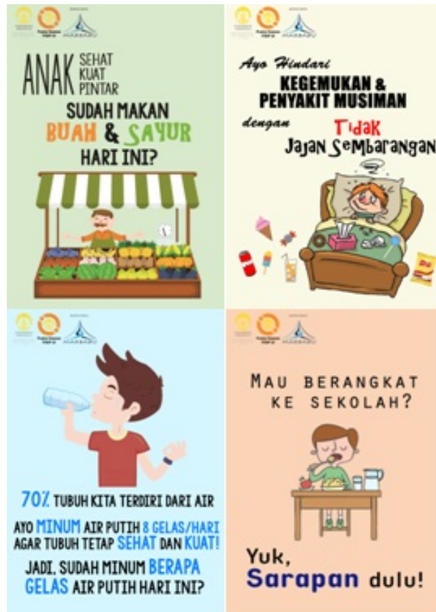
Figure 2. Poster for Children Groups

In addition, children also should maintain knowledge and awareness from information obtained in a series of activities using posters that they can see in public areas. These posters are intended to persuade them to do better behavior in choosing food.