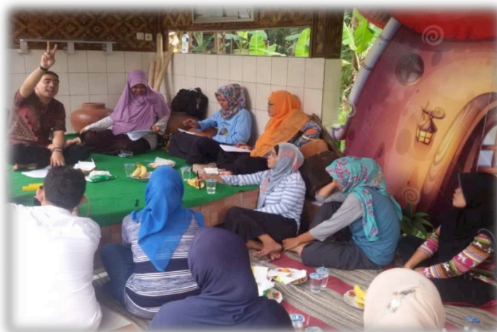
Figure 7. Nutrition Seminar for Local Leaders and Agents

Local community has responsibilities to ensure that children in their neighborhood meet their needs including nutritious food needs. In the Cinangka community, we involved local leaders and Family Welfare Program Agents (PKK cadres) to support the parents/caregivers in providing and controlling their children food consumption. To knowledge and consciousness raising, they joined in nutrition seminar and discussion. Furthermore, they developed communication skill enhancement in order to educate, support and control children and family groups in their community.