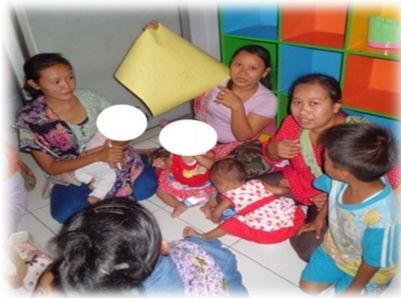
Figure 4. Knowledge and Consciousness Raising for Parents Group