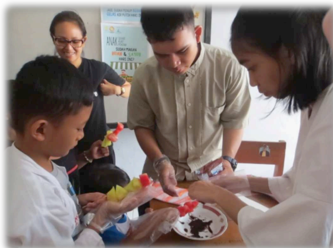
Figure 3. A child tried to make his own food

In order to skill enhancement, practice is targeted at increasing children's skills in choosing foods that are healthy and good for them. The technique is carried out through training to choose healthy and good food and training to provide healthy food independently.