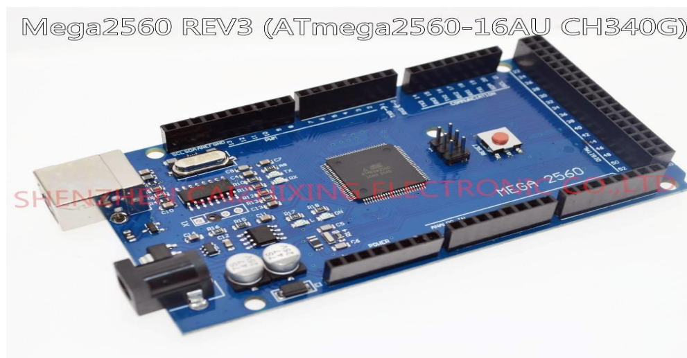
Fig. 1. Arduino Mega 2560