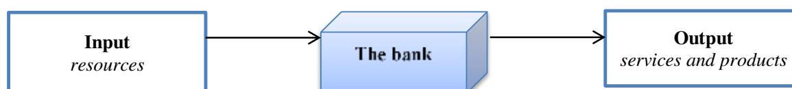
Fig. 1. „Input” and „Output” in banking

The distinctive features of these approaches are presented in the table below: