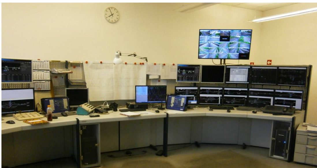
Fig. 2. General view of a command control room for train control