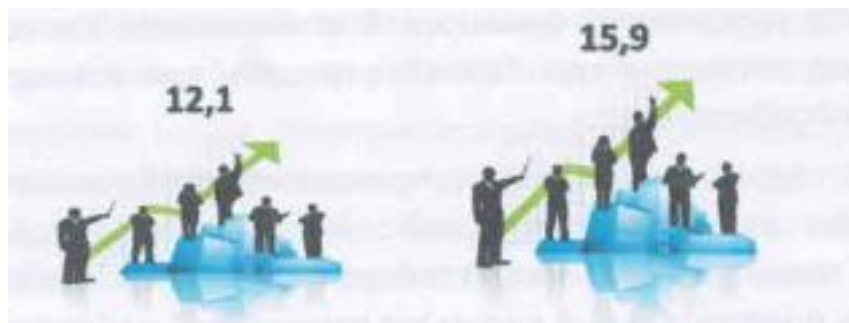
Fig. 2. Increased loans issued to small business in 2015 and 2016(in trillion sums) [3]

Looking at the examples below, given opportunities to entrepreneurs can be clearly understood: