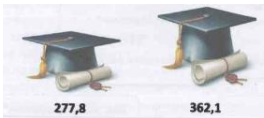
Fig. 3. Increased loan given to the young entrepreneurs in 2015 and 2016 (in billion sums) [4]

– Supporting the young people, graduated colleges and want to do business, the amount of loan given to them in 2016 is 1,3 times more than the one in 2015 (362.1 billion sums). (Figure 3)