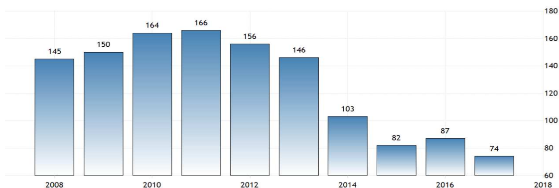
Fig. 1. Ease of doing business in Uzbekistan. [2]

Uzbekistan is ranked 74 among 190 economies in the ease of doing business according to the latest World Bank annual ratings. The rank of Uzbekistan improved to 74 in 2017 from 87 in 2016 (Figure 1).