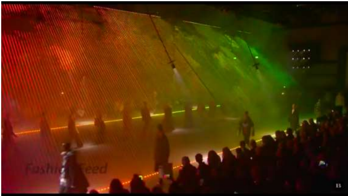
Fig.1. Burberry. London. 2018/2019. Designer - Christopher Bailey

Such techniques can simulate certain visual-spatial image, can change the perception of scale and proportions, can create dominance, place accents, emphasize dynamism or stativity. (Pic. 1)