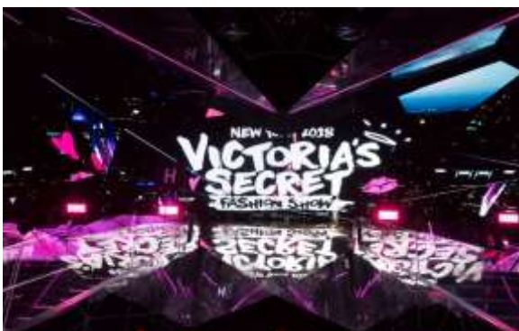
Fig.2 Victoria's Secret Fashion Show 2018

While certain elements are illuminated, highlighted in color, some decorative lighting accents are placed, other parts of the area remain dark. This creates a sensation of light and shadow, the focal and the secondary, and it forms an illusion of an objective real world with its essential and emotional characteristics.