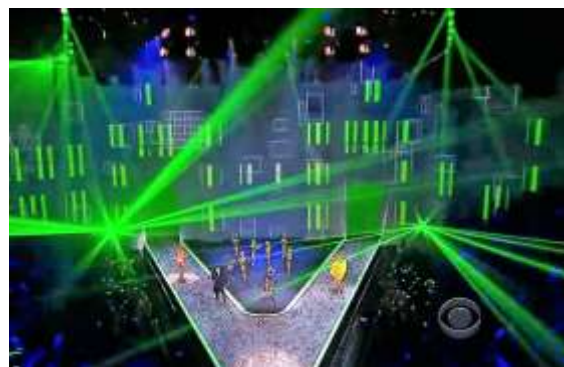
Fig.3 Victoria's Secret Fashion Show 2009

A vivid example of using 3D visuals on stage and podiums are showcased during the Victoria Secret fashion presentations. (Pic. 2) Modern computer equipment capabilities help create