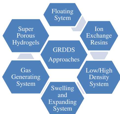
Figure 1: Approaches for gastro retentive drug delivery system

Drugs that are absorbed from the stomach include antacids, antibiotics albuterol, chlorthalidone, are rapidly absorbed from GIT [12-13]. Drugs having low bioavailability e.g.- ranitidine, misoprostol, and drugs which are poorly soluble in intestinal pH e.g.- diazepam, dipyridamole is also reported to show good response as FDDS [14]. It releases at the site of absorption and thus enhanced bioavailability.