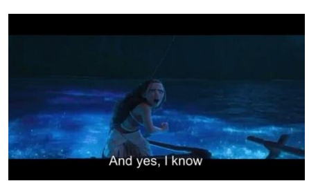
Figure 7. Moana crossed the sea for her grandma and for her people (ego)

In this scene, Moana's grandmother fell sick. Moana felt pity when she saw her grandmother helpless. There are few dialogues between Moana with the grandmother.