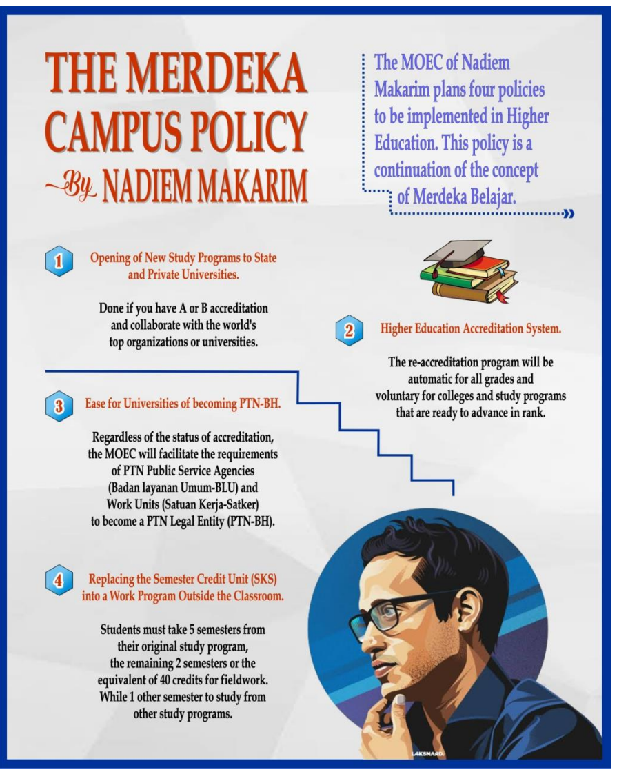
Figure 2. The ilustration of 'Kampus Merdeka'

The Merdeka Campus policy is a continuation of the concept of Merdeka Belajar . Its implementation only changes ministerial regulations, not to change Government Regulations or Laws. There are four main points: