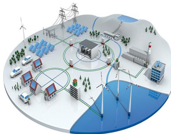
Figure 1. Advances Smart Grid Concept

It is capable of meeting increased consumer demand without adding infrastructure which shows its efficiency. Accepting energy from virtually any fuel source including solar and wind as easily and transparently as coal and natural gas; capable of integrating any and all better ideas and technologies energy storage technologies. This grid enables real-time communication between the consumer and utility so consumers can tailor their energy consumption based on individual preferences, like price and/or environmental concerns. This creates new opportunities and markets by means of its ability to capitalize on plug-and-play innovation wherever and whenever appropriate. A new technique for 'scheduling' energy in electric grids has been developed. It moves away from centralized management by tapping into the distributed computing power of energy devices. The approach advances the smart grid concept by coordinating the energy being produced and stored by both conventional and renewable sources.