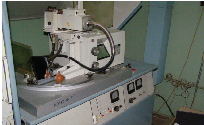
Fig. 1. DRON-UM-1 X-ray diffractometer