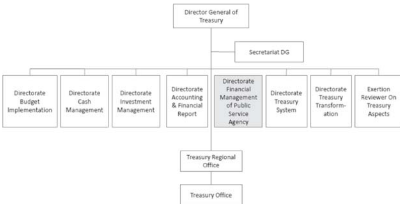
[FIGURE 2] ORGANIZATION CHART OF THE DG TREASURY OF THE MINISTRY OF FINANCE

Along with the MoF, line ministries are one of core pillars in the PSA governance. As briefly mentioned above, many government organizations that provide public services to citizens wish to get a PSA status because PSAs are privileged to enjoy a wide range of autonomy with a low degree of requirements for accountability and