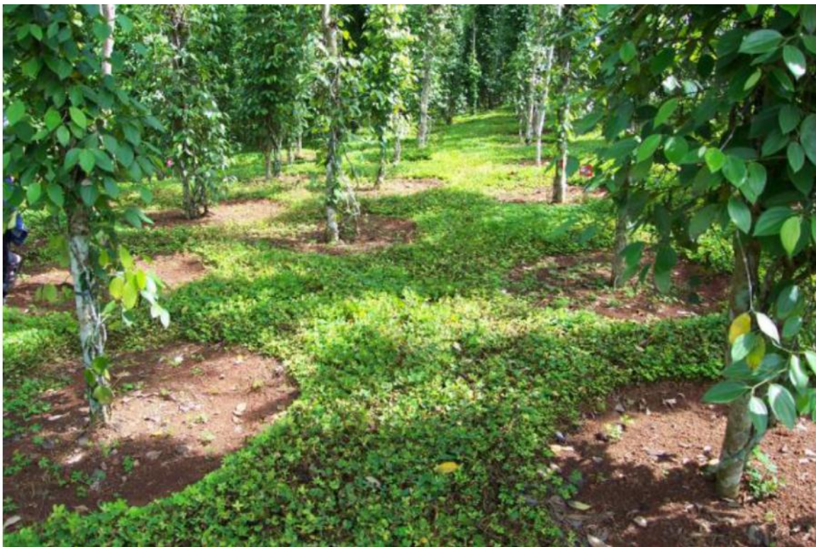
Figure 2. Vegetative conservation measure using Arachis pintoii as life mulch for pepper ( Piper nigrum ) production (Agus and Widiyanto 2004).