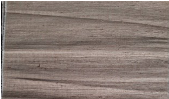
Figure 2. Woven fiber ambon banana frond stems