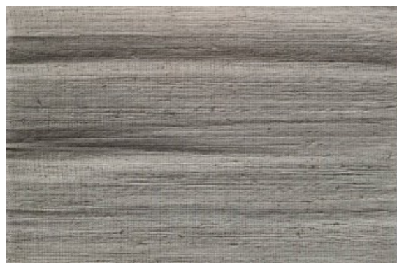
Figure 1. Pineapple leaf fiber is a woven fabric.

The resulting woven fabric can saw in Figures 1 and 2. Characteristics of material are analyzed, namely physical and mechanical components.