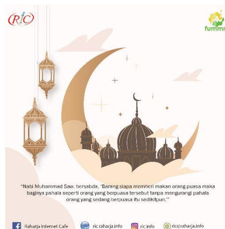
Figure 4 Ramadhan

Figure 3 is a poster design of OVO 1k promo information which will be at Raharja Internet Cafe (RIC), for the poster size of 640px X 640px which will be posted on RIC social media.