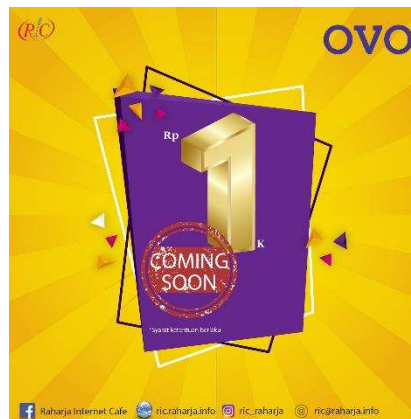
Figure 3. Rp.1K Coming Soon OVO Promo

communication media used as promotional media that will be applied to Raharja Internet Cafe (RIC). and will publish the results of poster designs on social media.