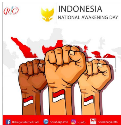
Figure 12. National Awakening Day

Figure 12 This poster design is a medium used to welcome National Awakening Day which falls on May 20th.