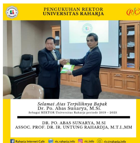
Figure 5. Inauguration of Raharja University Chancellor

Figure 4 is a poster design that is a medium to welcome the coming of the holy month of Ramadan, and congratulation fasting to the whole community especially private Raharja, for the poster size is 640px X 640px which will be posted on social RIC Media.