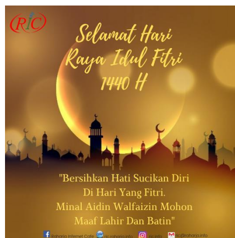
Figure 11. Eid al-Fitri

Figure 10 This poster design is a medium used to welcome the birthday of Pancasila which falls on June 1.