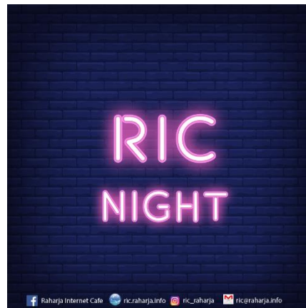
Figure 9. RIC Night

Figure 8 is a poster design which is a medium to congratulate all Buddhists who celebrate Vesak Day.