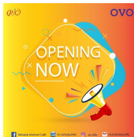
Figure 7. RIC collaboration with OVO

Figure 6 is a promotional media such as certain events that took place at Raharja Internet Cafe (RIC) and in the poster gives the event period to be held, namely OVO Promo Rp. 1K.