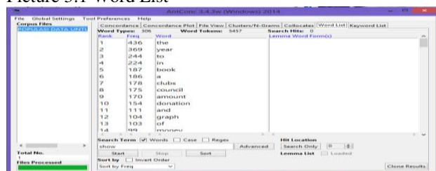
Picture 3.1 Word List

From the picture 3.1 above, it can be seen that determiner ‘the’ appeared as much as 436 times. Those typical appearances also happened when the researcher made a test by typing other verbs such as show , give , inform , increase , decrease , rise , and fall . Determiner ‘the’ is the most frequent word used by the students. Those students preferred to use closed class instead of using other words (open class) to show their language performance. Since the topic that was given about the graph, the 2nd place that appeared from their writing result was ‘year’. This word ‘year’ appeared as much as 369 times from the total of word occurrences. Then it was followed by preposition ‘to’ and ‘in’ appeared as much as 244 times and 224 times respectively. These findings are about to discuss in the following.