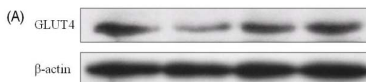
Figure 3. AL-1 elevated GLUT-4 translocation to the plasma membrane of soleus muscles [17]

Blood glucose levels of diabetic rats that were fed with AL-1 at the dose of 80 mg/kg bw were the group that intensively decrease on the blood glucose levels on the day of 0, which was about 65%. This change was 2 times higher compared to the andrographolide group with the dose of 50 mg/kg bw with the decline about 32.3%. Thus, giving AL-1 was more effective in lowering blood glucose levels. While the test of insulin serum levels, AL-1 at dose 80 mg/kg bw increase the insulin serum levels better than andrographolide at the dose of 50 mg/kg bw. The same results were also shown on pathologic and immunohistochemical analysis of mouse pancreatic test. In that study, Zhang et al proved that the AL-1 could be one of the anti-diabetic agents by lowering fasting glucose levels as well as protection against beta cell destruction [17].