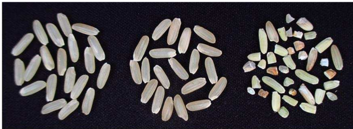
Figure 2. Classification of brown rice by thickness in L.

ECOLONG® 424-100 type, ECOLONG® 424-140 type and ECOLONG® 413-180 type: see text.