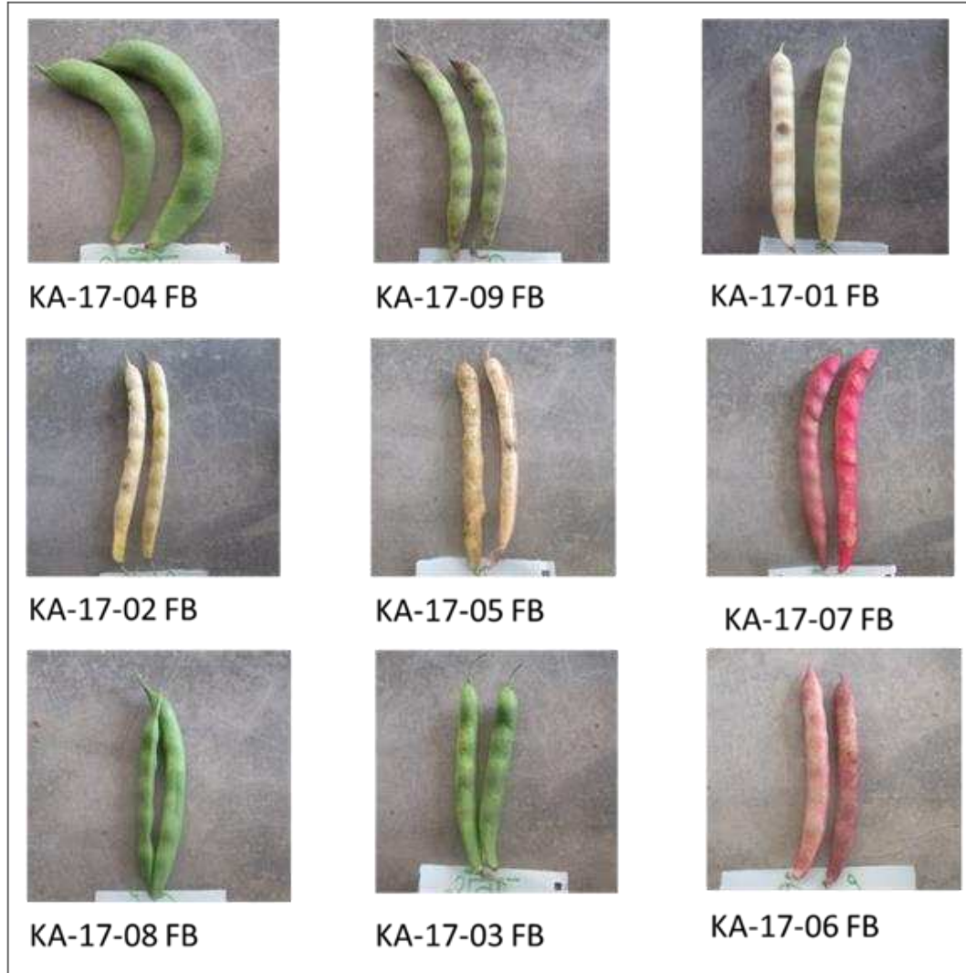
Figure 2. Pod curvature of expanded immature pod.

yellow, red or other colors. Most of the evaluated genotypes (five) had yellow colored pods. These were KA-17-08-FB, KA-17-09-FB, KA-17-03-FB, KA-17-04-FB, and KA-17-01-FB. KA-17-07-FB had red-colored matured pods and KA-17-06-FB had pale yellow. Only KA-17-02-FB had pale yellow pods with colored stripes. Likewise, curvature of fully expanded immature pod was categorized as straight, slightly curved, curved (Figure 2). The difference in pods curvature was noted among different varieties.