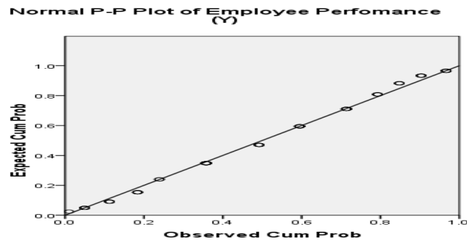
Figure 3. Normality