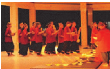
The performance part I: "Maraso-rasoi"