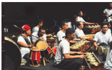
Rehearsal part III: "Basitungkin" Photo by: Asep Saiful Haris, 2017