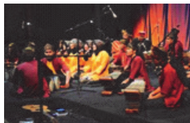
The performance part III: "Basitungkin" Photo by: Asep Saiful Haris, 2017

Through the elaboration of the idea on further work from the two concepts of performance, the writer tried to apply something related to the idea of the contents, as well as working material with its manifestations into the work form which is divided into four parts, including: