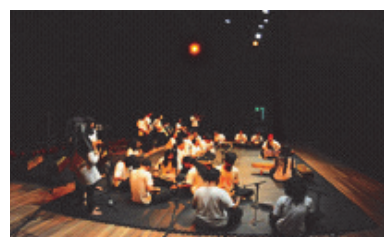
Rehearsal part II: "Adu Manis"