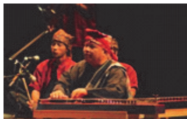
The performance part II: "Adu Manis" Photo by: Asep Saiful Haris, 2017