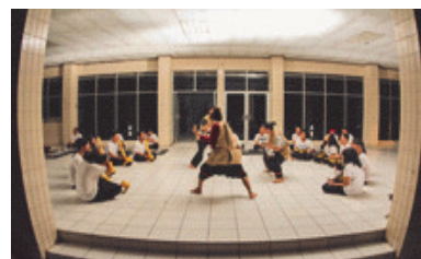
Rehearsal part I: "Maraso-rasoi" Photo by: Asep Saiful Haris, 2017

Apart from that, another form offered is to try to manifest "theatrical musical" performance. The theatrical musical is more on "the player's expression." The expression here is an expression of an artist's feelings through some creative acts raised by interpretation, inspiration, plays, and pleasure in doing the show. To objectify the performance form by using the concept of "theatrical music," each player or a musician is assigned a role which is suitable for the instrument being played. It is intended to make other musicians easier in the process of the performance when there is dialogue in the musical forms, such as producing vocal sounds, gestures, and other sounds responded back by a tool or instrument that has been determined.