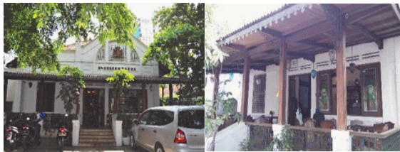
Pic 1. Façade architectur of the Indischetafel Café

Indischetafel Café is a family restaurant owned located in the old town area, adjacent to the Bancey region, which has been known since the 1870s and Braga. Historically, the Braga region was known as an elite area of European people gathering since 1879. Indischetafel Café's public room begins with a terrace, then a lobby and the dining area. The terrace is functioned as a dining area for smokers because it is open area and has directly an access to the outside of the building. The lobby is a room that has an open access directly to the terrace. In the lobby, there is a cashier area and a place of display for pastry. The dining area inside the building is divided into four rooms. Three medium-dimensional rooms and one large-dimensional room are used for the dining area. This is an adaptation to the initial function of the building as a residential facility.