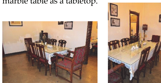
Pic 5. The dining area 3 of the Indischetafel Café

The dining area 3 contains two dining tables. It has indoor access to the dining area 4. The dining area 3 has a double shutter window. Framed wooden window shutters with clear glass and wooden leaf window. The window shutters have wooden frames with clear glass and wooden window. The window in the dining area 3 is not functioned as an opening. The floor is gray-hexagonal shaped tile. The ceiling has a height of about four meters. There are decorative lamps on the ceiling with yellow lights. Portable camera obscura and gramophone become the icons of the past in this area. Gramophone is a music player from Europe produced around 1918. In this space, the object is placed on an eight-pointed white marble table as a tabletop.