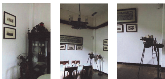
Pic 3. The dining area 1 & the display object of the antique sewing tools as the enrichment of space.

to the dining area 4 that has a large dimension. On the right and left side of the alley, there is an access to three other dining areas. The dining area 1 is located on the right side of the corridor from the lobby, which is a window opening with double shutters. The wood-framed wooden shutters have clear glass and wooden window shutters. The floor is a hexagon-shaped tile with a dark gray. The ceiling has a height of about four meters. There are decorative lamps on the ceiling with yellow lights.