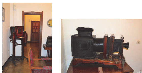
Pic 6. The portable camera obscura as the icon of the dining area 3.