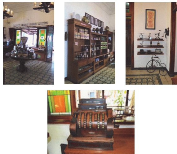
Pic 2. Lobby area of the Indischetafel Café with the antique cash register and plectocycle, which are the icons of the lobby

bring up the theme of Bandung tempo dulu . On the right side, there is the cashier area. Next to the counter, there is a showcase for pastry. In the central room, there is a table to display a jar containing cookies, with a display cabinet containing special snack of Bandung as the background. The antique cash register is one of the icons in the lobby area which is very relevant to the theme of Bandung tempo dulu because of its European nuances. The cash register was discovered in 1819. It operates without the electricity. Another icon in this area is a plectocycle or tricycle which very 1819's European nuances, the year in which the object was for the first time patented in England as Denis Johnson's creation. The floor area of the lobby is the motif tiles with green circular pattern surrounding border. The walls have wooden-framed window openings, with stained glass. The ceiling has a height of about four meters. On the ceiling of the lobby area, there are decorative lamps with the selection of yellow lights.