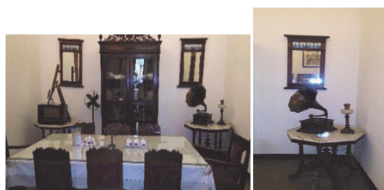
Pic 7. A gramophone and antique binoculars as the icon in the dining area 3.