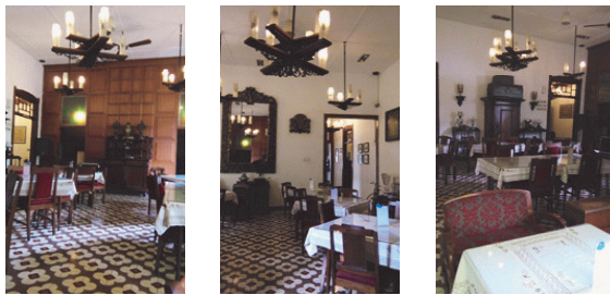
Pic 8. The pictures show the dining area 4.

A large dimension of the dining area 4 has a wooden framed window with stained glass similar to the lobby area. An accordion piano is one of the icons in this dining area. The accordion and casing are placed on the crate that functioned as a table. The accordion piano is one of four types of a gramophone. European nuance arises because the instrument which was created by C.F.L. Buschmann, in 1822, comes from Berlin, Germany. The floor of the room is tile motif of four dark red petals with borders surrounding it. In the four dining areas, their ceilings have a height of about four meters. There are decorative lamps on the ceilings with yellow lights.