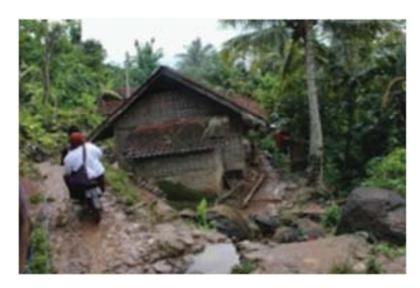
Figure 3 Kampong outer Dukuh