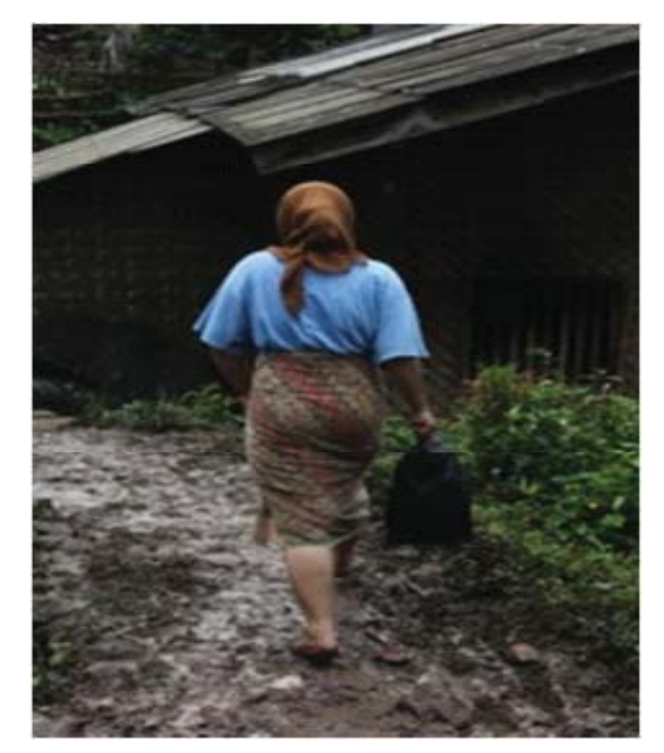
Figure 4 Road to Kampong Inner Dukuh

his leadership reconstructs the traditions of Kampong Dukuh in Garut regency.