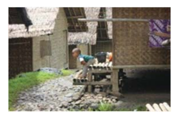
Figure 2 Kampong Inner Dukuh

belief they hold from generation to generation. Preference, belief and norm shape human behavior a s the result of genetic evolution and parts of pamali inheritance from ancestors and acquired from learning and social interaction.