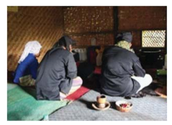
Figure 8 Holy water (prayer-contained water)

on Saturday only. Secondly, a civil servant should not walk into the area of Syech Jalil's grave. Thirdly, every visitor to Syech Jalil's grave should be clean and free of impurities. Fourthly, one should not spit around the area of Syech Jalil's grave. Fifthly, a visitor should walk barefoot to Syech Jalil's grave. Sixthly, women's area is separated from men's area. Seventhly, a male visitor should wear plain clothes, without any motif or decoration, and no underwear. It is recommended that he dresses in black. Eighthly, a female visitor should wear a kebaya (a Sundanese traditional blouse-dress) and an undecorated plain sarong usually worn by male with no panty and bra. Ninthly, a newly engaged couple is forbidden to walk into the area of Syech Jalil's grave. Tenthly, any member of Dukuh community visiting Syech Jalil's grave should wear black clothes, sarong and headband.